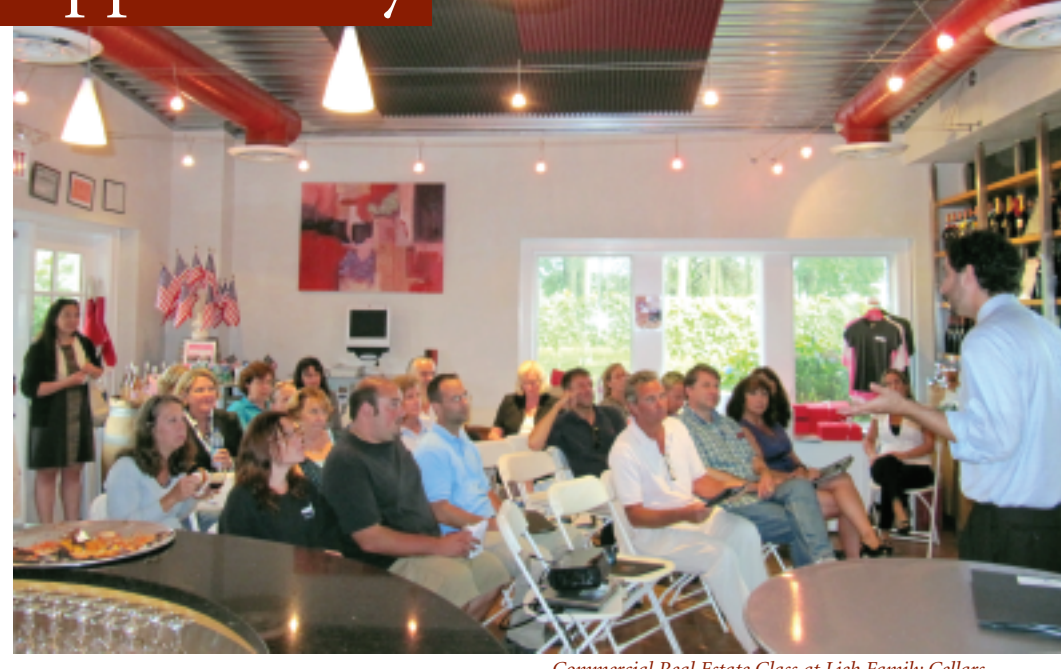
Commercial Real Estate Class at Lieb Family Cellars

and serve their clients. Becoming an expert in a new area may not be an easy task, but these agents are motivated to reach the greater community. Clients who've relied on residential brokers and agents to sell their two acre waterfront dock and cottage, are now requesting them to sell the corner plot of land adjacent to the seafood market that has been in their family for generations. These brokers and agents must seize the opportunity.